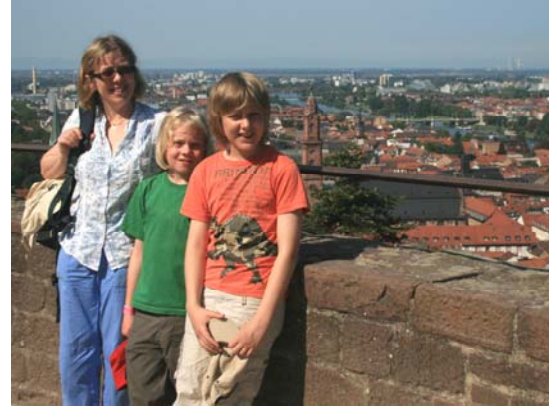
Summer in Germany, exploring castles and a zoo in Heidelberg, and a Natural History Museum (and another zoo) in Stuttgart