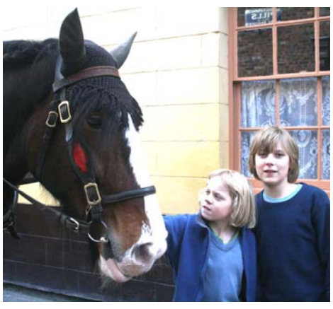
Late sun at Ironbridge, exploring our engineering heritage