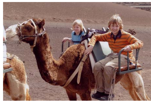
Early sun in Lanzarotte, riding camels.....