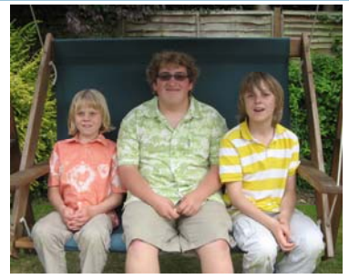
...friends from Seattle