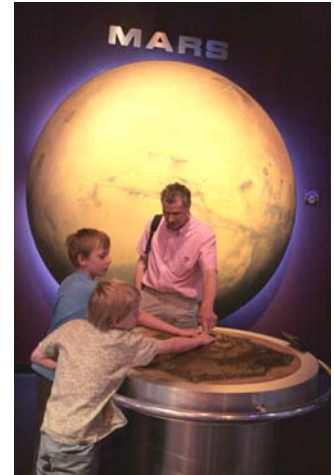
Touching rocks from Mars (probably)

Much of this year has been spent on space travel. In April, whilst in the USA, we visited the Kennedy Space Centre (as well as a few space simulator rides at Disney World's Magic Kingdom and Epcot).