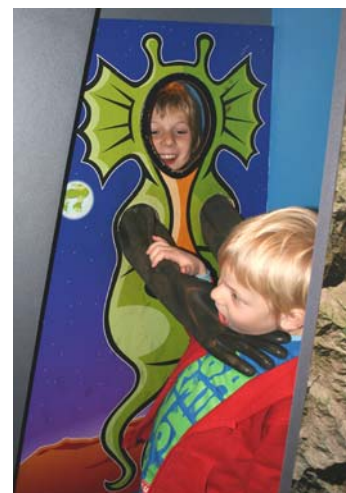
Alien life spotted in Leicester

In search of more news from outer space we ventured as far as Leicester during the October half-term to the National Space Centre. Worth the visit, apart from the hour-long queue to get in.