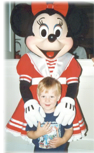
It's a small world after all