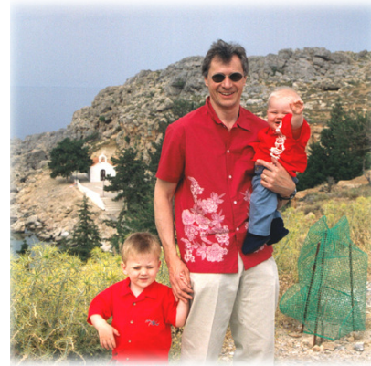
Wedding guests at St Paul's Bay, Lindos